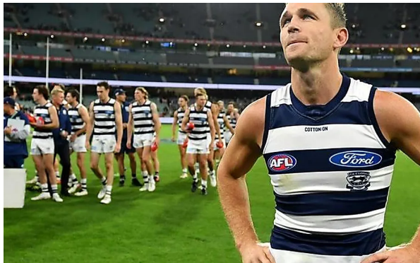
Cats expect key duo to make AFL returns